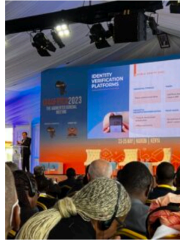
State of ID4Africa Movement Keynote, 2023