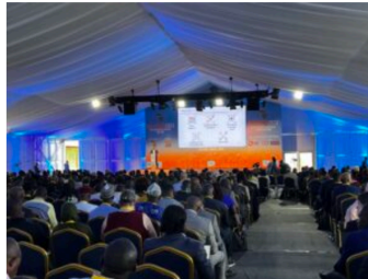
ID4Africa General Assembly 2023