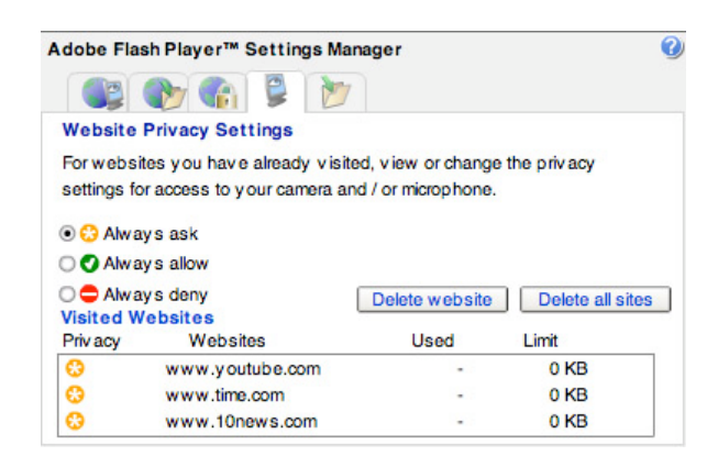
Figure 2: Adobe Flash Player Website privacy settings panel. The setting for this panel is set so that no information will be stored in the Flash cookie.

Adobe has a web site that allows users to set the LSO folder in ways that can include rejecting flash cookies altogether. <sup>52</sup> (See Figure 2 for what this looks like). However, most users do not know about Flash cookies, and even fewer know how to manage or disable Flash cookies.